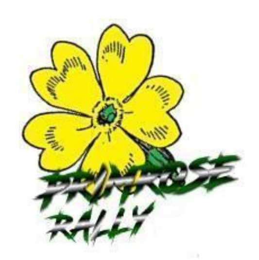
Saturday 11th and Sunday 12th January 2025